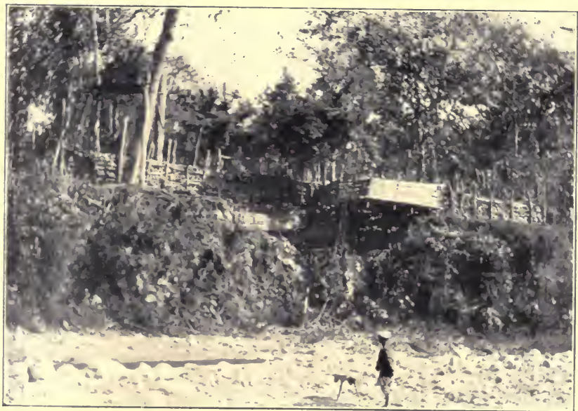
THE WALLED FACE OF FORT BOWER OVER THE RIVER.